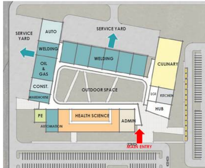
(2 nd floor)